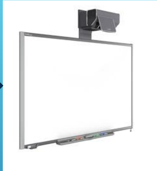
IWB – Interactive Whiteboard