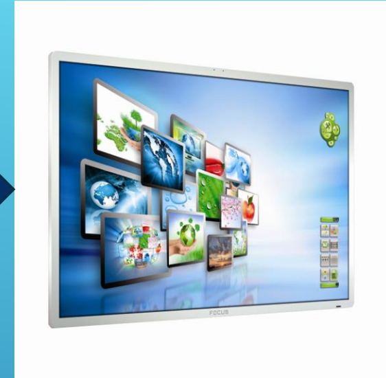
IFPD – Interactive Flat Panel Display