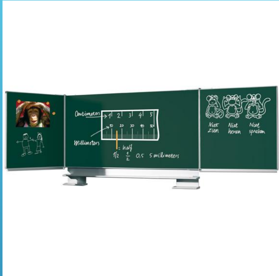
OLD SKOOL – Conventional boards